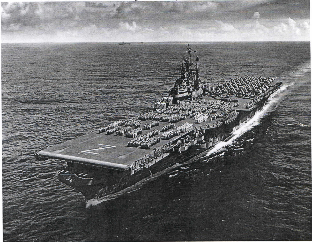
Photo # 80-G-278827 USS Shangri-La underway in the Pacific, 17 August 1945

SHANGRI-LA steaming in the Pacific on 17 August 1945 – two days after the ceasefire ending hostilities with Japan. The crew is at quarters on the flight deck for the first time since entering the combat area.